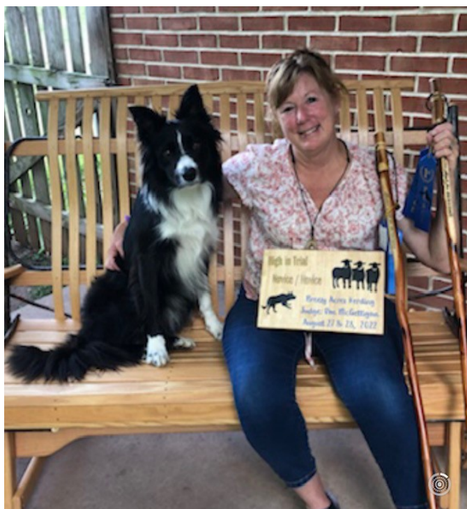
Monty's first trial, Taravale Farm: High in Trial Novice Novice

It was tough having a dog that was holding me back from advancing my handling while the new friends I had just made were able to move on up the ranks. Although I didn't have a dog to compete with, I decided I was going to need to buy some sheep if I wanted to accelerate my learning. I bought some Katahdins so I could practice and learn about the pressures in my field and how to read sheep. Our property consists of 21 acres with about half of it being woods. My original plan when we moved here was to set our place up for horses. Fortunately, it worked out well for training sheep too. In addition I have a wonderful neighbor whose field adjoins our property and he allows me use of it to practice Outwork and Driving. I currently own a mixed bag of sheep consisting of three young Black-faced Scotties, two Cheviots, nine Cheviot-Blue Faced Leicester crosses and two of my original Kathadins I started with. All told it makes for a nice small flock of 16.