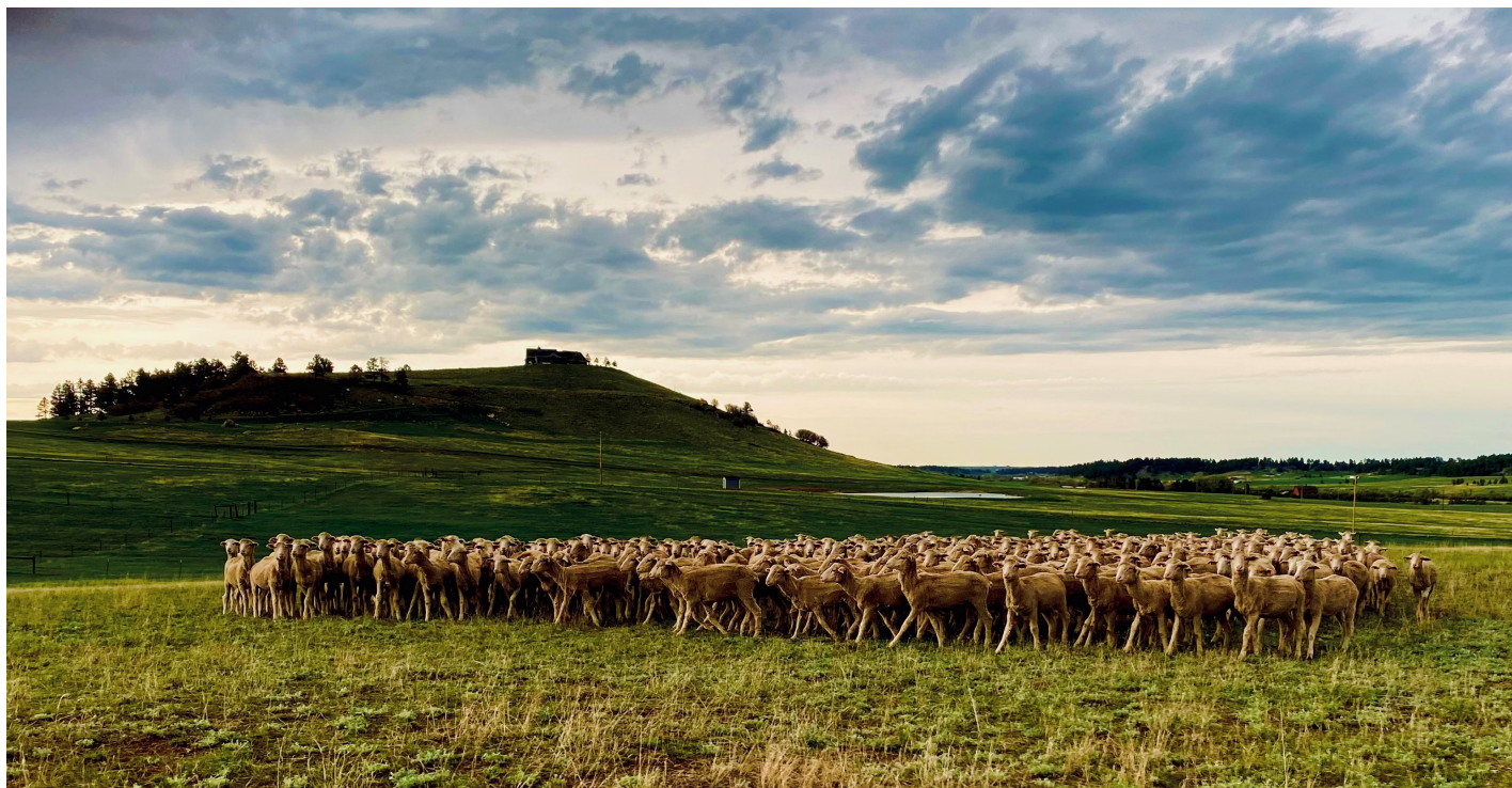
The flock of 400 range ewes

This year saw five intrepid NEBCA members trek to Larkspur, Colorado for the Tabletop SDT over Memorial Day Weekend: