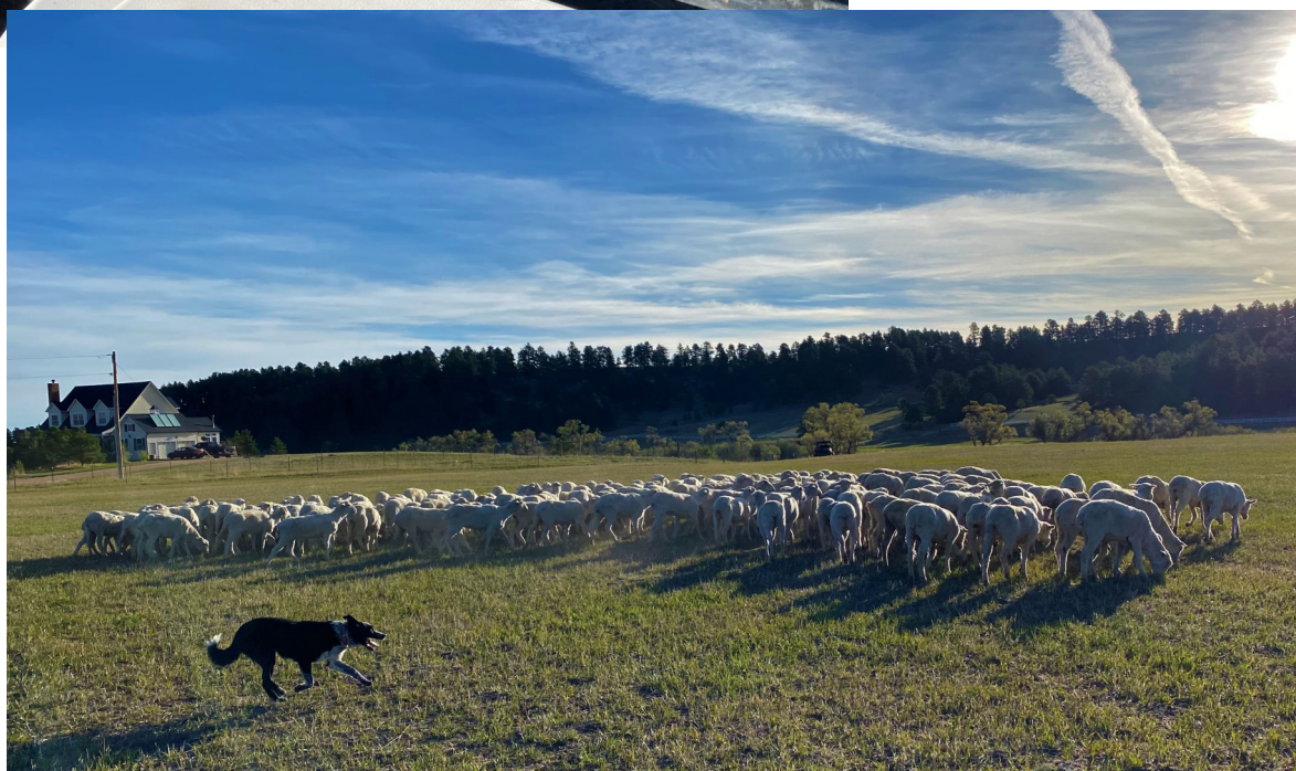
Moving the Flock

Ok secret's out. But it's not for the faint of heart. Three straight days of driving, big storms, and no guarantee you'll get them down the field. But I'm going back next year.