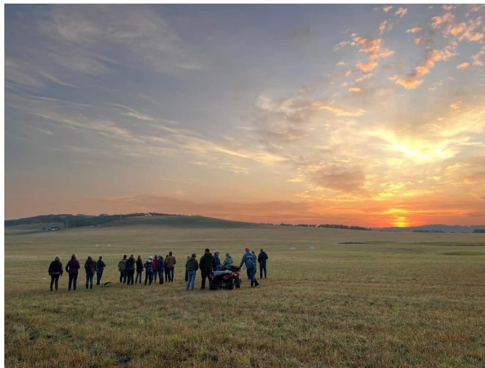
Handlers Meeting, Millarsville Albata