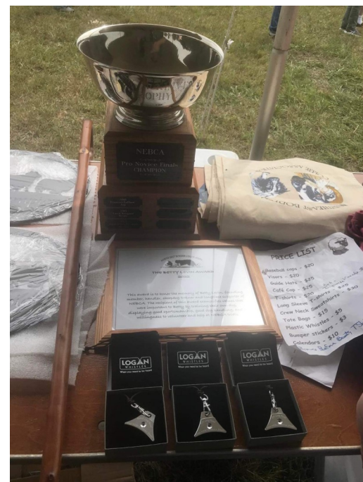
Handlers and dogs inspect the trial field