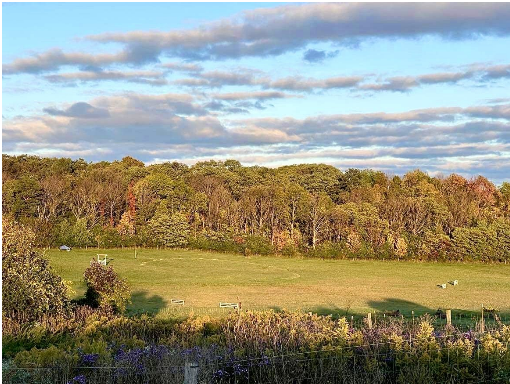
The trial field at Ox Creek Farm