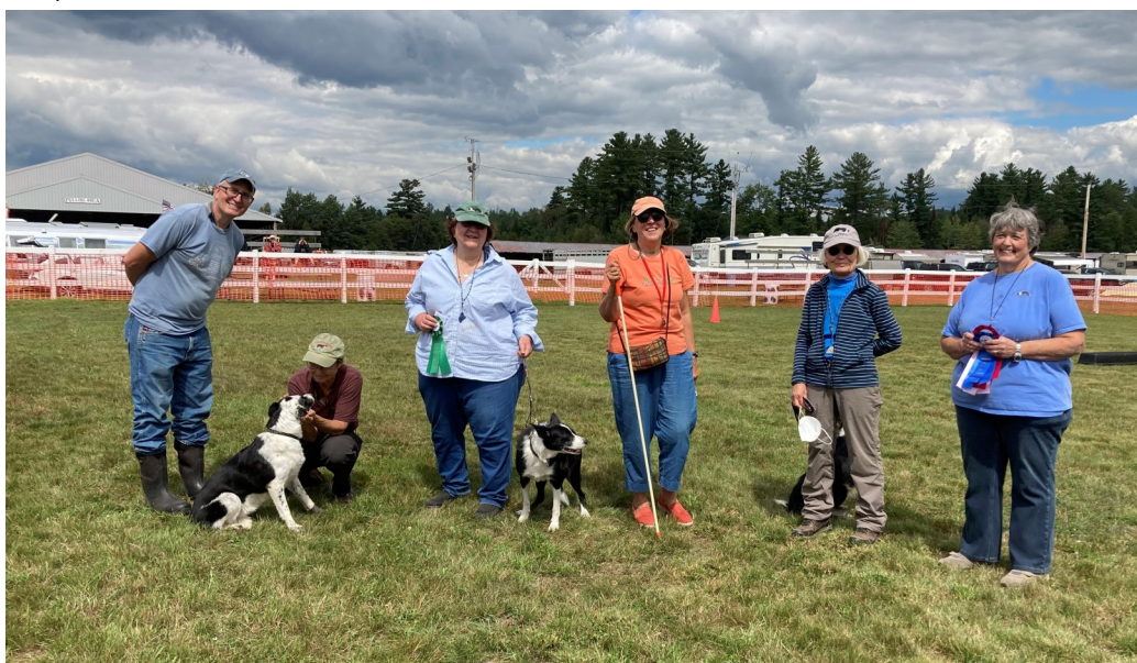
Lancaster Fair Handlers: