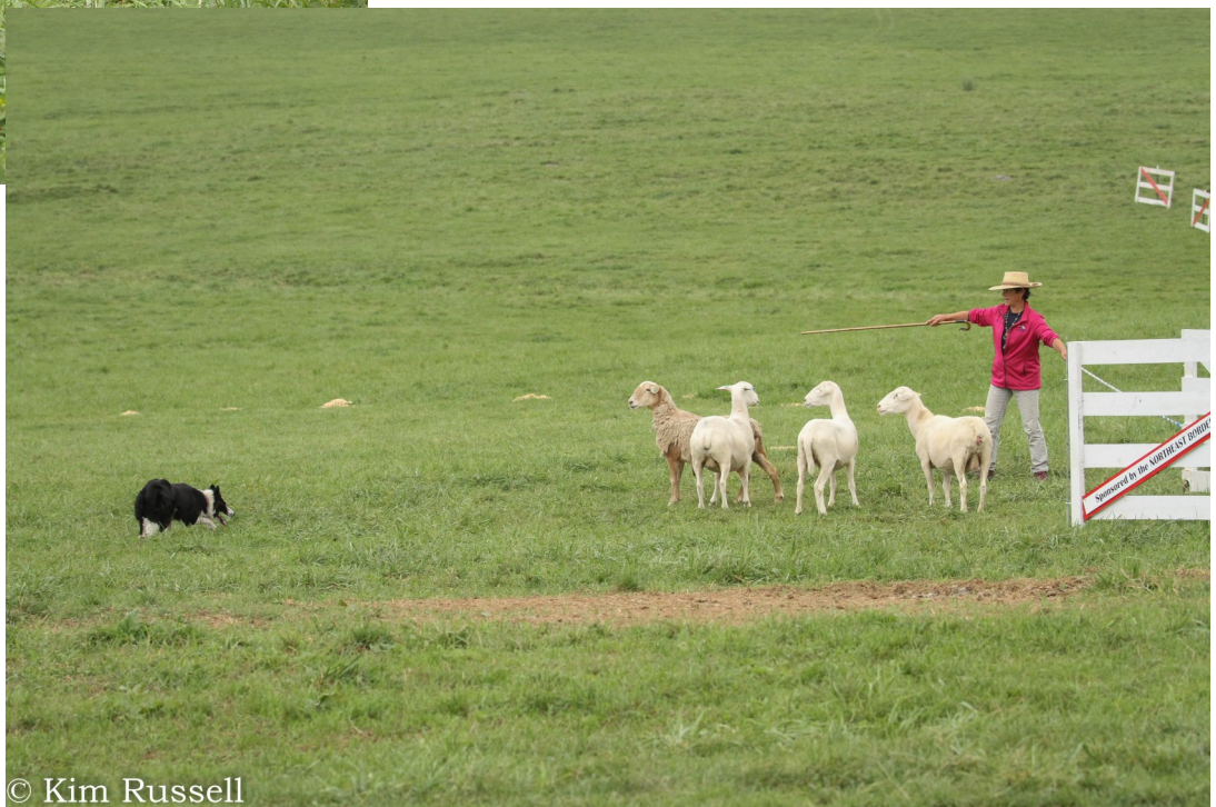
Getting the tricky pen