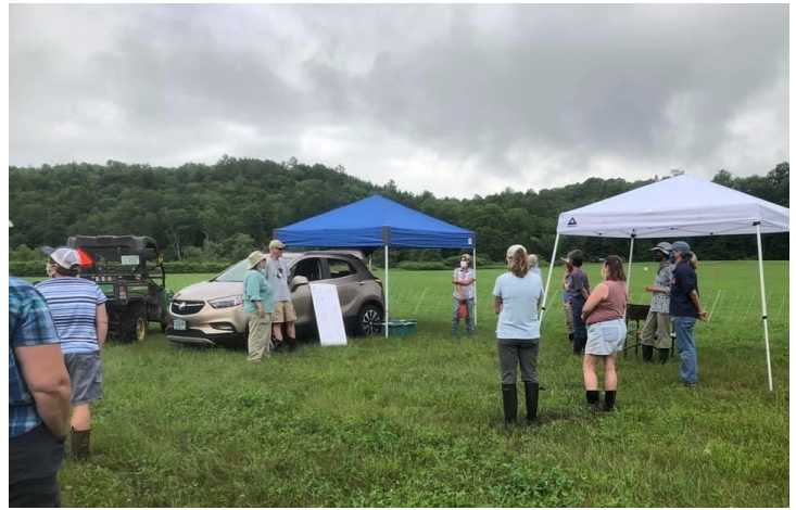
How to have a socially distanced Handlers Meeting

Saturday July 4 WORKSHOP: Each handler worked on handling skills through various activities. Teams rotated through the various parts. Order was: Hazing and Exhaust, Pen and Setout, Chill and Observe, Course work. Set out was the same place for every run. There were three set out posts for choice of outrun. There were fetch and drive panels. A chute was attached to the back of the pen and included a sorting gate. The last obstacle was to load into the stock trailer. Each handler had five minutes to work with their dog. Everyone brought a picnic lunch and we had a “Yankee Swap”. Top choice was a lap quilt with border collies on it. The afternoon was a repeat of the morning. In the evening we had a picnic dinner.