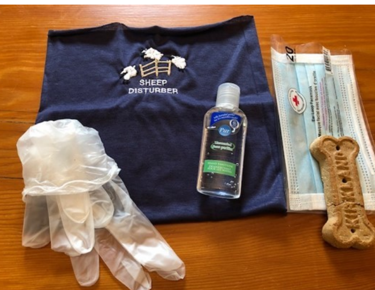
COVID Welcome Kit for Participants