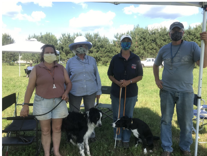
Team 3: Masks ON when social distancing not observed