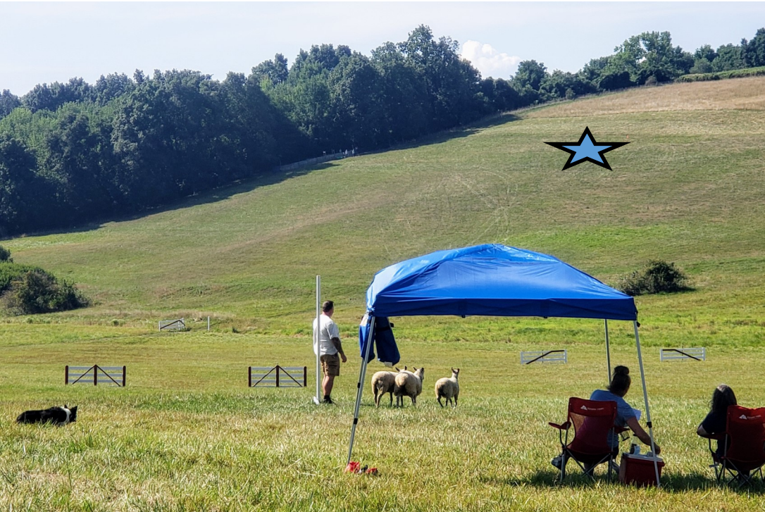
The view from the judge's tent: what a big beautiful hill. Sheep were set out at the star