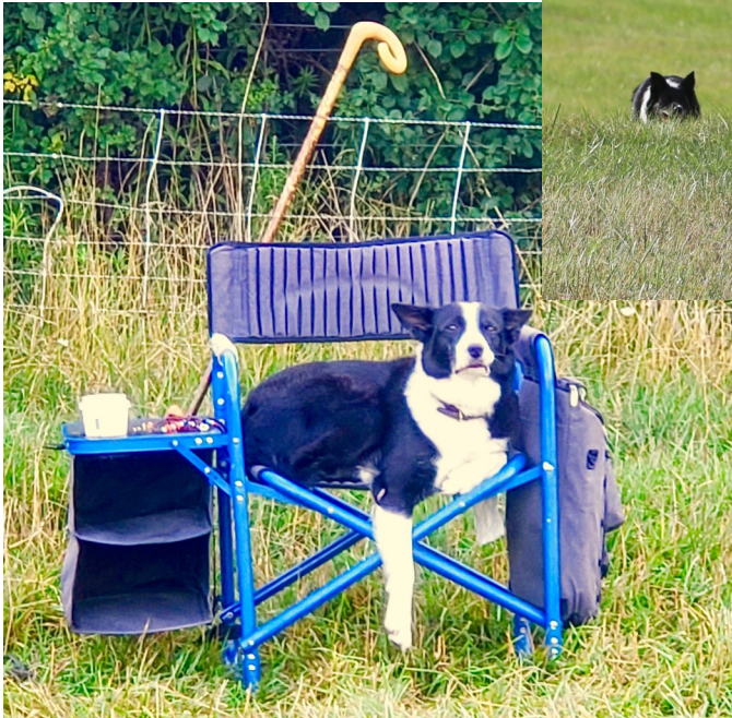
"Oh NO! I'm up FIRST!" Pam Mueller's Fly awaits