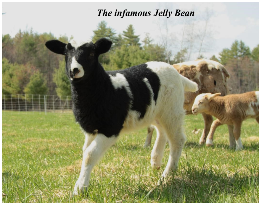
The infamous Jelly Bean

by the vet for about two days before I gave up. She stopped limping a couple weeks later, the bump on her leg went away. But Jelly Bean's bump had led us to an unexpected, exciting sheepdog adventure.