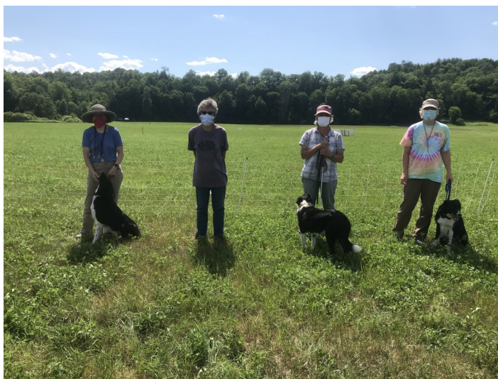
Team 2: Very professional