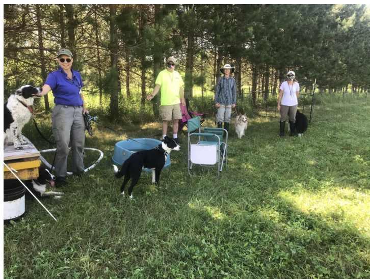
Team 4: They don't even seem to like each other.