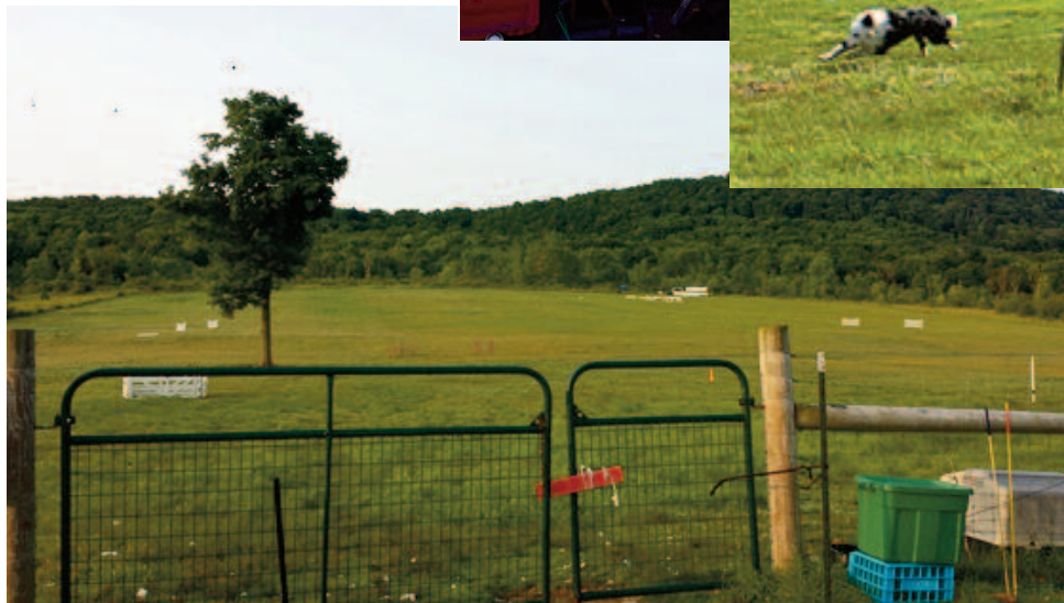
Fetch Gate Farm Trial Field