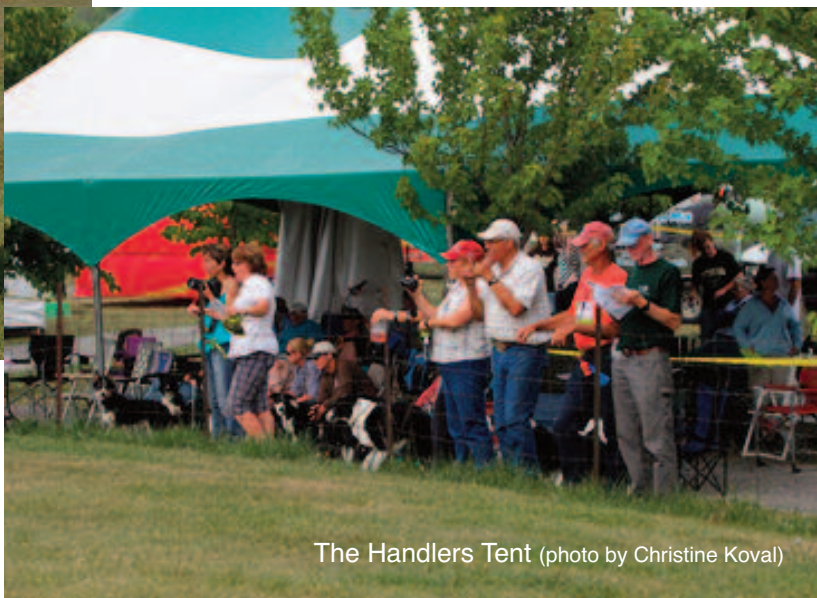
The Handlers Tent