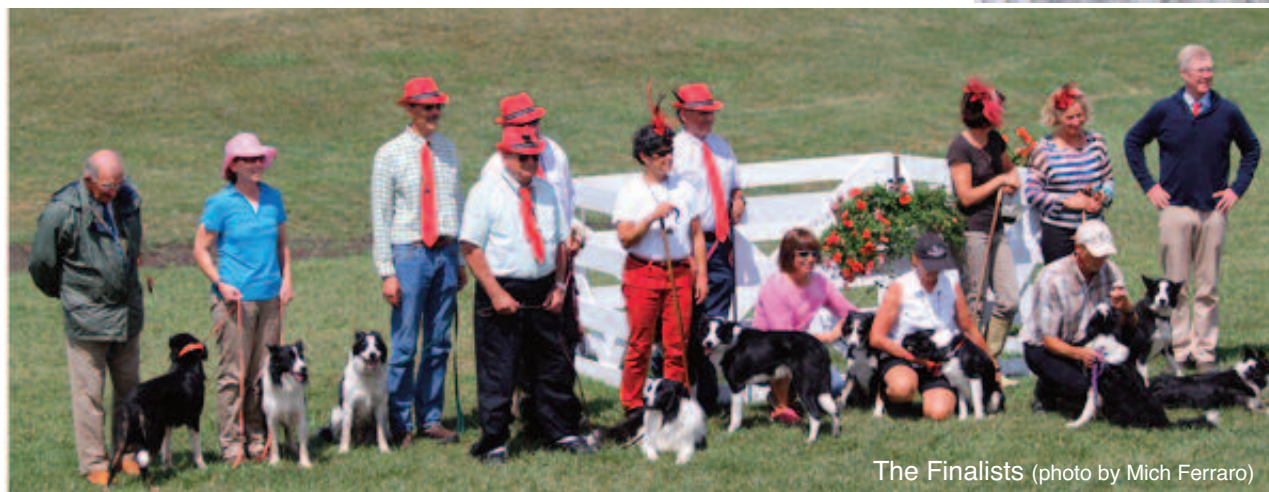
The Finalists