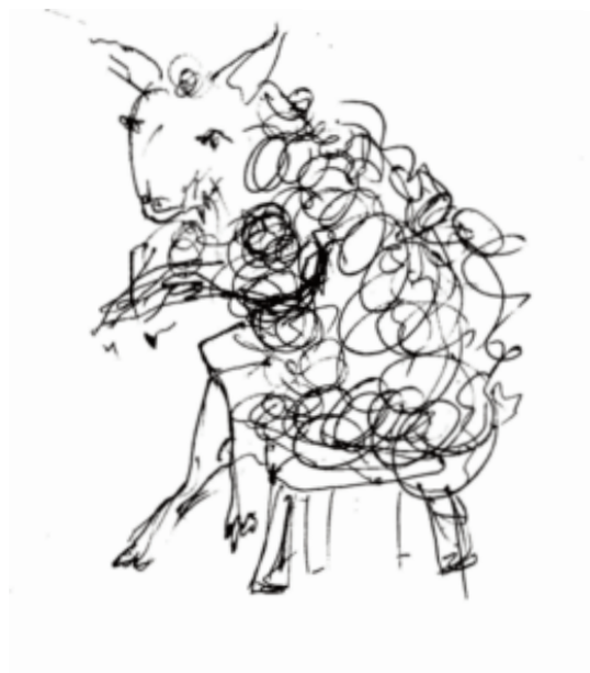
Whimsical sketches by Kate Collins