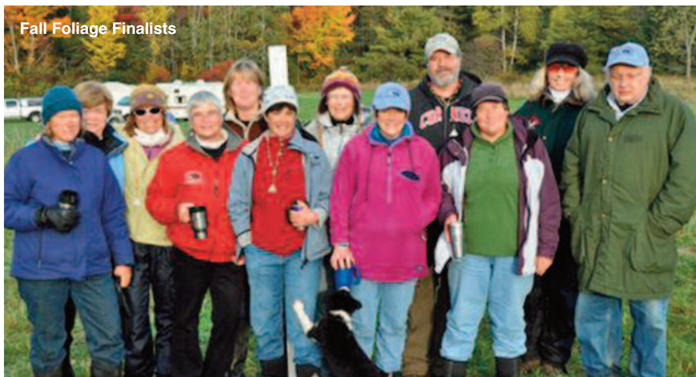
Fall Foliage Finalists