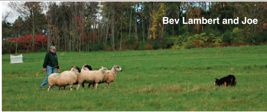
Bev Lambert and Joe

meeting and the first dog ran at 12:30pm. The sheep were set out in groups of four, with a mix of Scottish Blackface and mules. The mules proved to be somewhat more difficult than the Scotties, but not consistently so. The outrun was approximately 375 yards and set across the face of a hill (but also uphill) with several berms for drainage that put your dog out of sight on the way out to the sheep but also