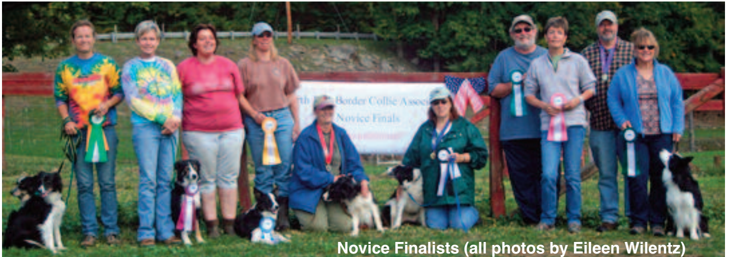
Novice Finalists