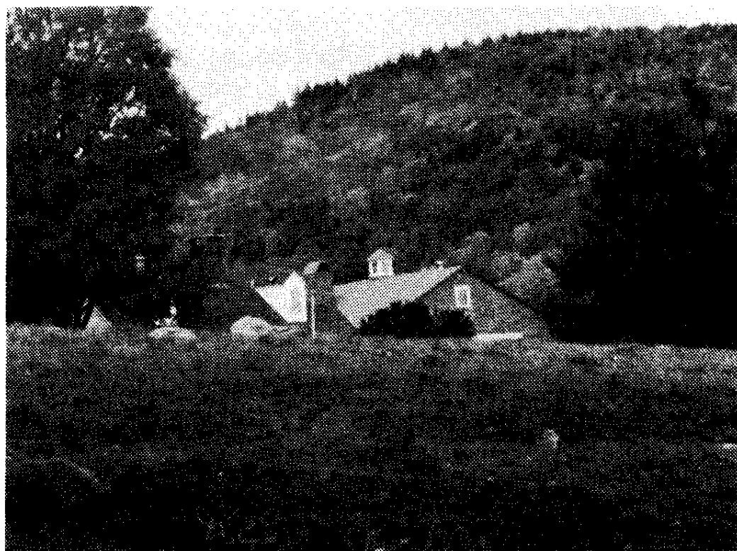
Keswick Farm - the site of our Annual Meeting