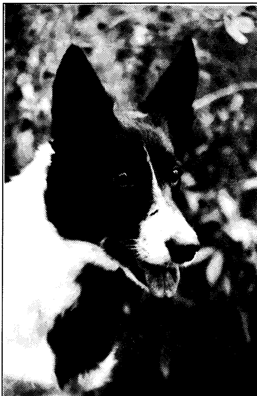
Eve Marschark's Spin

There is a beautiful view from the handlers post of mountain vistas, colorful foliage, distant towns and cathedrals - but you'll all just have to come back again next year to see it!