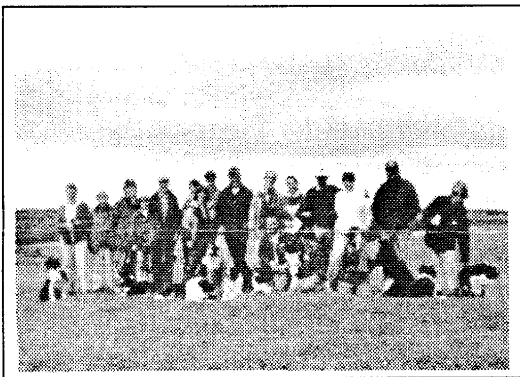
Trialers at the Northern-most Trial in North America