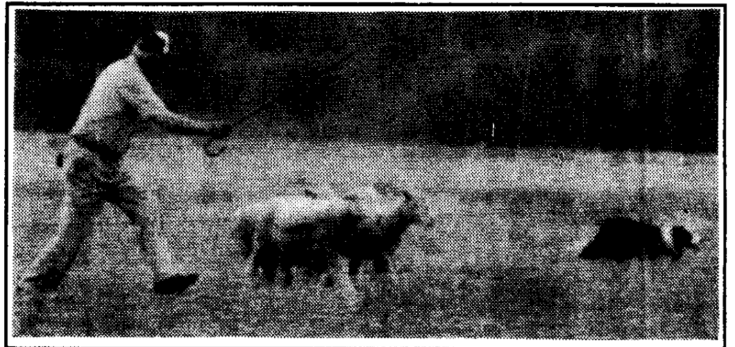
Walt Jagger hoofs it after some errant sheep at Sussex Fairgrounds (Story on page 3) Morris County Daily Record