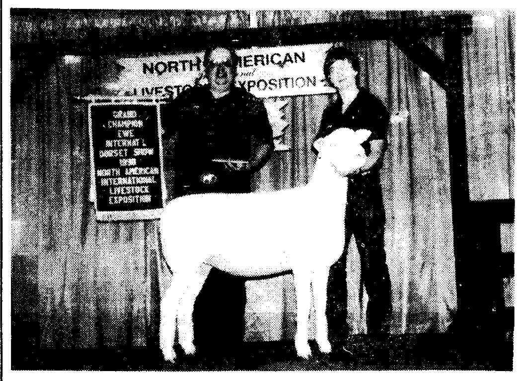
THE WINNER -- GRAND CHAMPION

The day finally came when we drove onto the grounds of the Kentucky Fair and Exposition Center. What a place! It looked more like a palace than a stock show. The outside was beautifully landscaped and the inside of the complex was truly a sight to behold. We were amazed at the spotless shine in the hall-