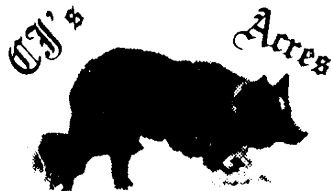
CHERYL JAGGER WILLIAMS

A complete line of custom-made Border Collie Items, including clothing.