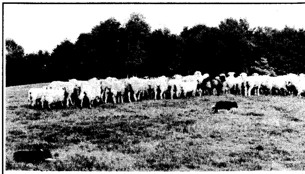
Boot with her Sheep

and paper quality you have been used to. We have decided to increase the number of annual issues to nine, concentrating on the months just prior to and during the trialing season. We will continue to put out the four quarterly issues, just like before. But we will supplement with monthly issues to fill continued page 2