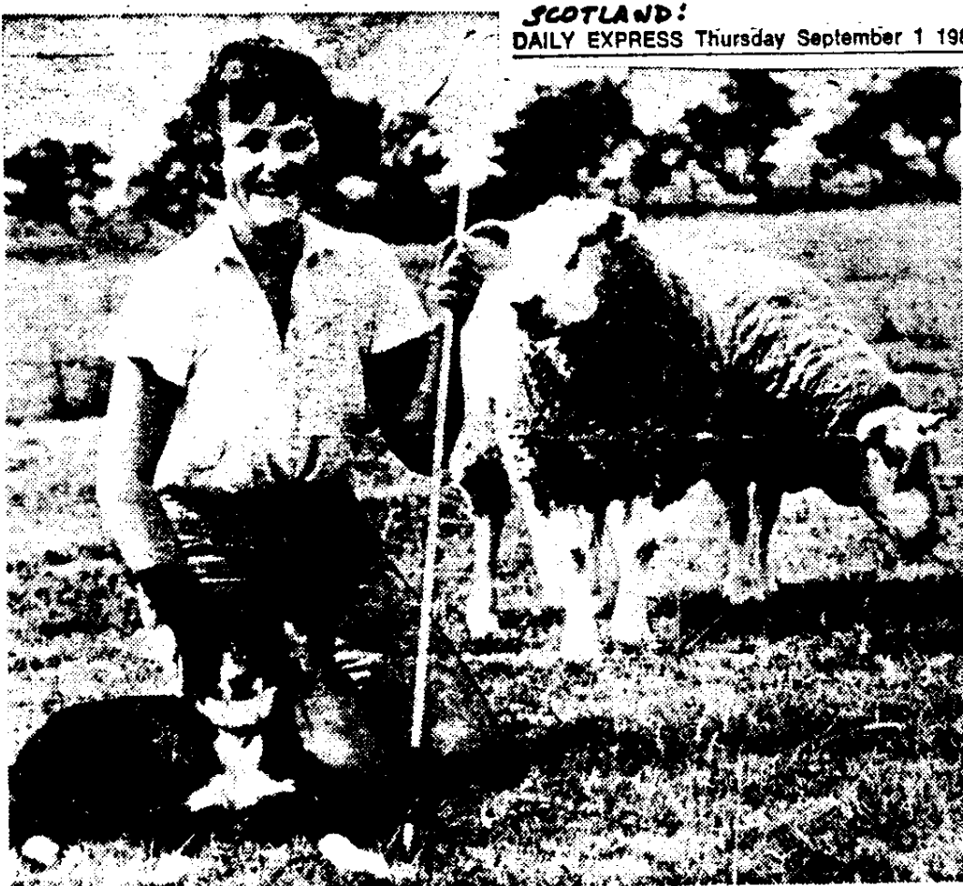
SCOTLAND: DAILY EXPRESS Thursday September 1 1983

The Calendar is out! And it's very nice this year. The front cover is a large, lovely color photograph, taken in Scotland, of a Border collie herding four sheep. Inside is packed with all sorts of goodies: pictures of handlers and their dogs; Border collies with lambs (nothing is more appealing); BCs herding ducks; close-ups at sheepdog trials; and more! At the back is a breeders directory, a dog whelping calendar, dog breeding records, etc. Send $5.00 (check made out to NEBCA) to Bonnie Holland at P.O. Box 165, Topsfield, MA 01983.