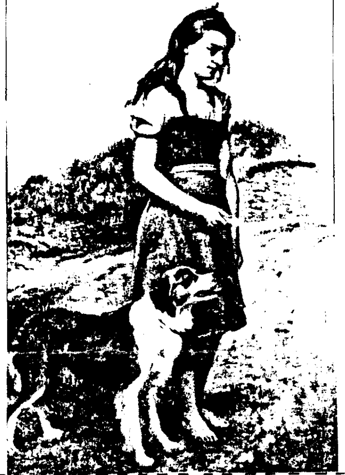
Girl with collie—from a painting by Richard Ansdell.