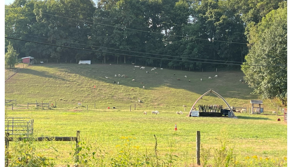
Sheep grazing the trial field at Breezy Acres

to see all of your lovely faces in the spring!