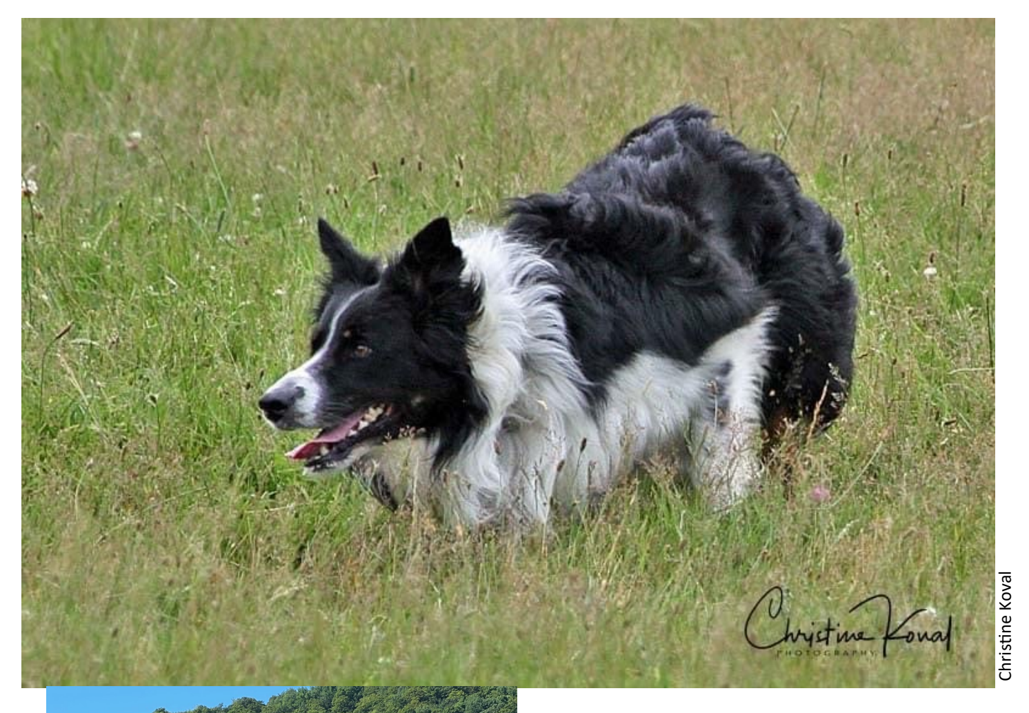
Carolyn West's Clyde scored a remarkable 99 to win Open 2