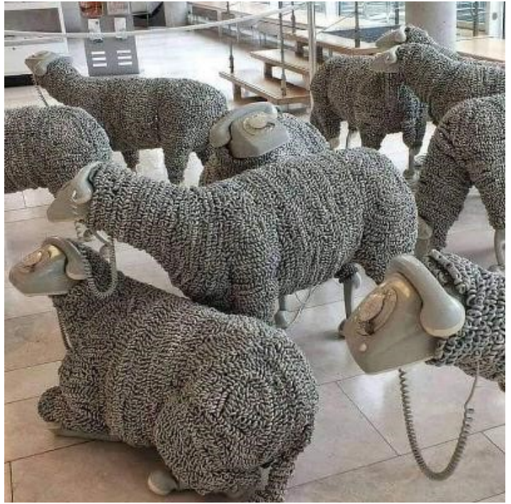
Mass resignation of telemarketers due to COVID brings new opportunities for sheep