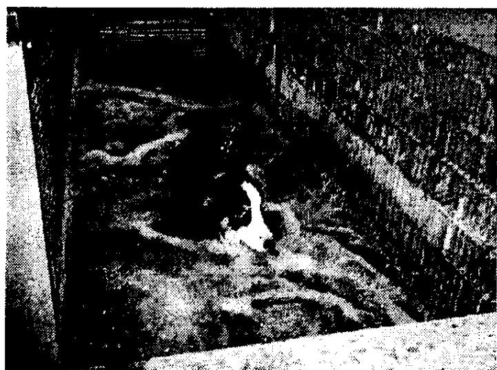
Jessie on a treadmill lowered in a whirlpool.

Hydrotherapy, Whirlpool, Massage, Treadmill, Therapeutic Ultrasound and more are the new tools to assist in the treatment and recovery of surgical and soft tissue injuries and chronic conditions. The buoyancy of the water-assisted treatments are thought to remove much of the pressure from the painful site, encouraging the animal to exercise a full range of motion, and thereby speeding along the recovery process. The warm water helps to reduce inflammation, pain and muscle spasm while increasing circulation and improving mobility.