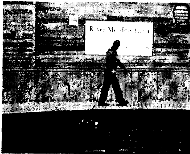
Denise walks along side as Jessie swims laps.

session, real muscle mass starts to develop, as in addition to the benefits of the weightlessness of the water, there is a natural resistance which fosters real muscle growth.